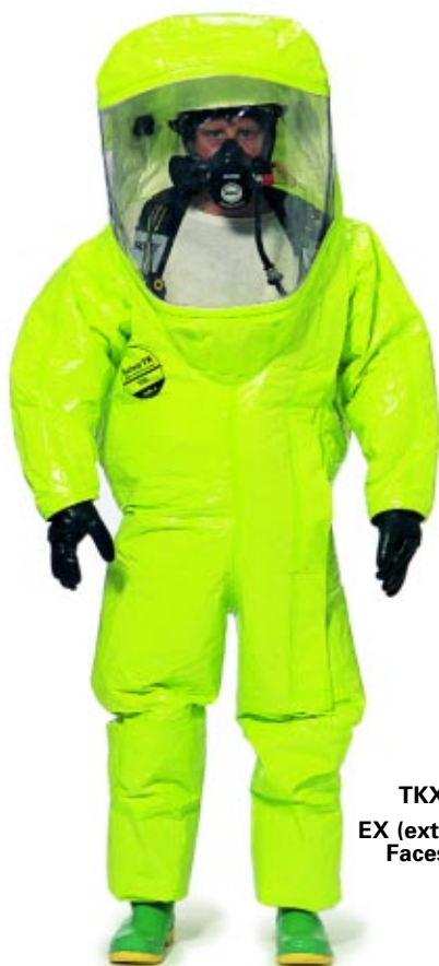
TKXFAB EX (extra wide) Faceshield